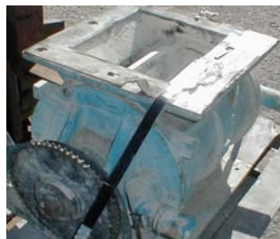
Rotary Airlock (before)

Rotary Airlocks protected with our ceramic solutions last 5 to 10 times longer than standard rotary airlocks.