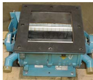
Rotary Airlock (after)

Conforma Clad 501 Park East Boulevard New Albany, IN 47150 USA Tel: 888.289.4590 812.948.2118 Fax: 812.944.3254 www.conformaclad.com KS-02 02/07 © 2007 Conforma Clad